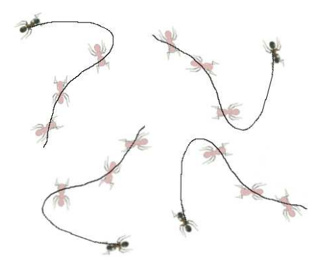
Fig. 3. Right-invariant coordinated swarm with varying velocity. (light color: intermediate positions and orientations in time).

circular motions are the only possible trajectories for leftinvariant coordination with steering control (this illustrates that left-invariant coordination under velocity constraints can impose restrictions on achievable relative positions). Note that right-invariant coordination in this setting would simply require the agents to agree on a common rotation rate \omega ; this can be solved with a classical linear consensus algorithm.